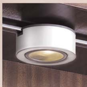
9MXP100L20-WH Puck with Xenon 20W lamp 2 1/2" Dia. x 1" H