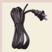
9CP48-BK 48" Cord & Plug with On/Off Switch