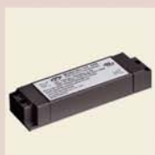
9TR150 150W Transformer