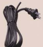
9CP48-BK 48" Cord & Plug with On/Off Switch