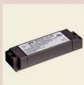
9TR060 60W Transformer