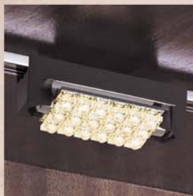
9MLF100L02-BK 2W LED CCT=3500K 3"W x 1 1/4"D x 1"H