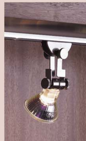
9MM1100L20-29 MR11 with Helogen 20W Lamp