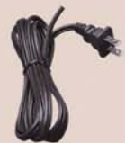
9CP48-BK 48" Cord & Plug with On/Off Switch