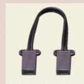
9MJC06-BK 6" Jumper Cord