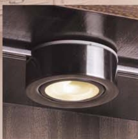
9MXP100L20-SS Puck with Xenon 20W lamp 2 1/2" Dia. x 1" H