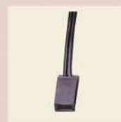
9MECLF48-BK Live-in feed with 48" wire