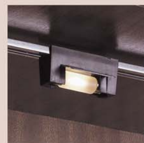
9MXF100L10-BK Festoon with Xenon 10W lamp 2"W x 1/2"D x 1" H