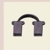
9MJC02-BK 2" Jumper Cord