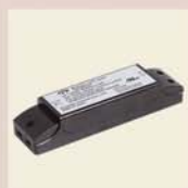
9DR012 12W LED Driver